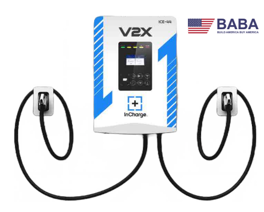
ICE-44 V2X DC Fast charger