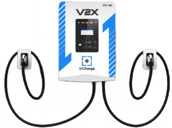
ICE-44 V2X Dual CCS1