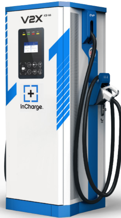
ICE-66 V2X Dual CCS1