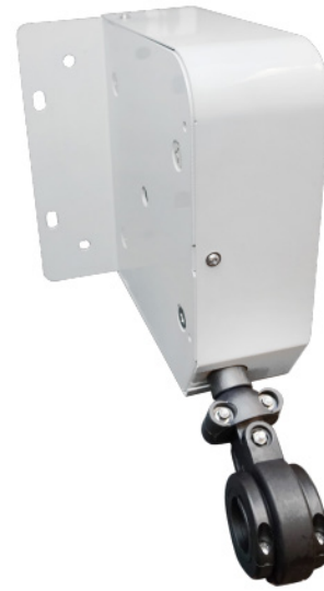
Wall Mount Cable Retractor