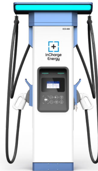
Slim Line Dispenser (Light Bar with Cable Retractors included)