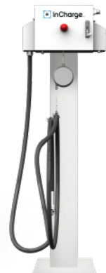
Micro Dispenser (Pedestal not included)