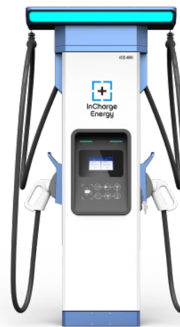
Slim Line Dispenser