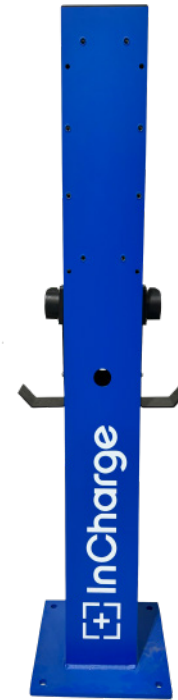
Single or Dual Mount Level 2 Charger Pedestal