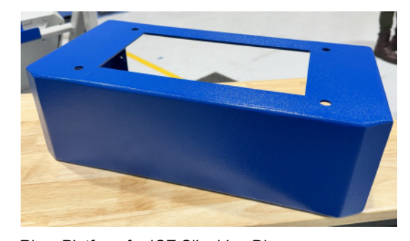
Riser Platform for ICE Slim Line Dispenser