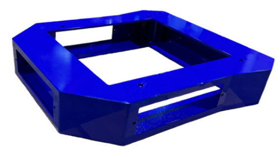
Riser Platform for ICE-60/120/180

The Riser Platform offers a faster, less disruptive solution by enabling cable routing through access on both sides or the rear of the platform.