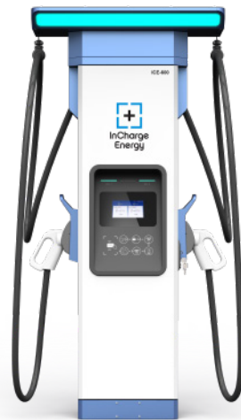
Slim Line Dispenser