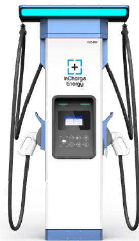
Slim Line Dispenser