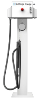
Micro Dispenser (pedestal sold separately)